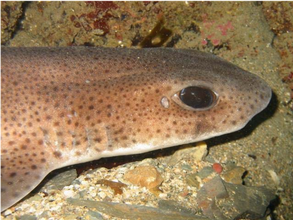
Dogfish/Rock Salmon © D Gilby